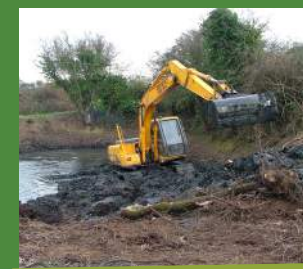
During - November 2011