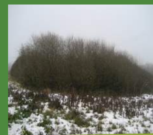
Before - December 2010

Since spring 2010, the UCL Department of Geography, University College London has been studying three small farmland ponds in a before-and-after restoration project. One of these ponds, Sayer's Black Pit, was profoundly overgrown by willow and blackthorn scrub, and UCL's studies revealed a near-complete absence of water plants, dragonflies and amphibians. It underwent management in September 2011 with major tree and scrub removal. Only two years after restoration, Sayer's Black Pit has high plant cover, an incredibly species-rich dragonfly fauna and four species of amphibian, including great crested newt.