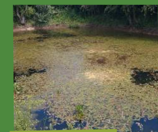
After - June 2013